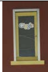
Google Ann Arbor