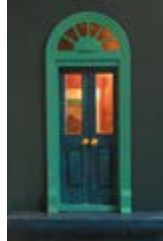
Ann Arbor Library