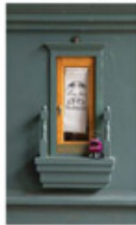
7. Peaceable Kingdom