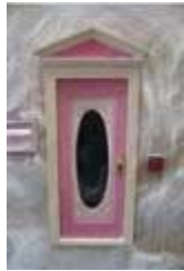
Ann Arbor Sewing Center (Not within walking distance.)

The following page shows the current "tourable" Fairy Doors in Ann Arbor. (as of 2012)