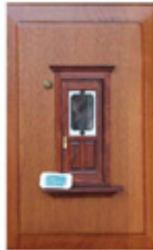
4. The Ark