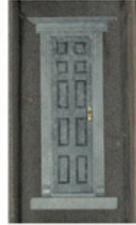
A Goblin Door I do not like to reveal the location, because it does not seem wise to encourage people to be monkeying about a goblin door. It seems that a goblin or goblins have made this out of jealousy of the urban fairies. Obviously goblins because of the unseemly location (pigeon poo and cigarette butts) and tall proportions of the door.