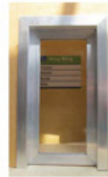
9. UofM Mott's Children's Hospital