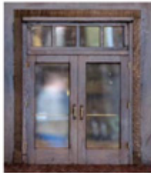
1. Michigan Theater