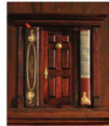
10. Nicola's Books

Note: Some locations are exterior, some are interior, some have BOTH exterior and interior features...or even multiple points of interest.