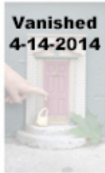
Vanished 4-14-2014 3. Selo-Shevel Gallery