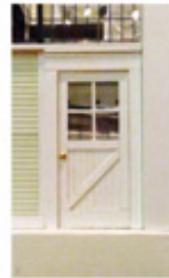
8. Found Gallery