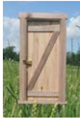
Field of Dreams