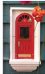
5. Red Shoes