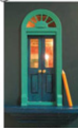
2. Ann Arbor District library