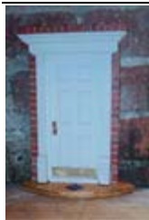
Sweetwaters Coffee & Tea