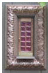
Jefferson Market & Cakery