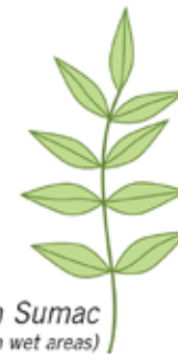
Poison Sumac (Grows in wet areas)